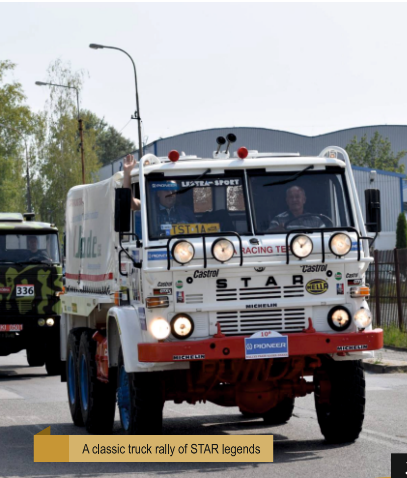
A classic truck rally of STAR legends

Welcome to the Region of Power in the Kamienna Valley.