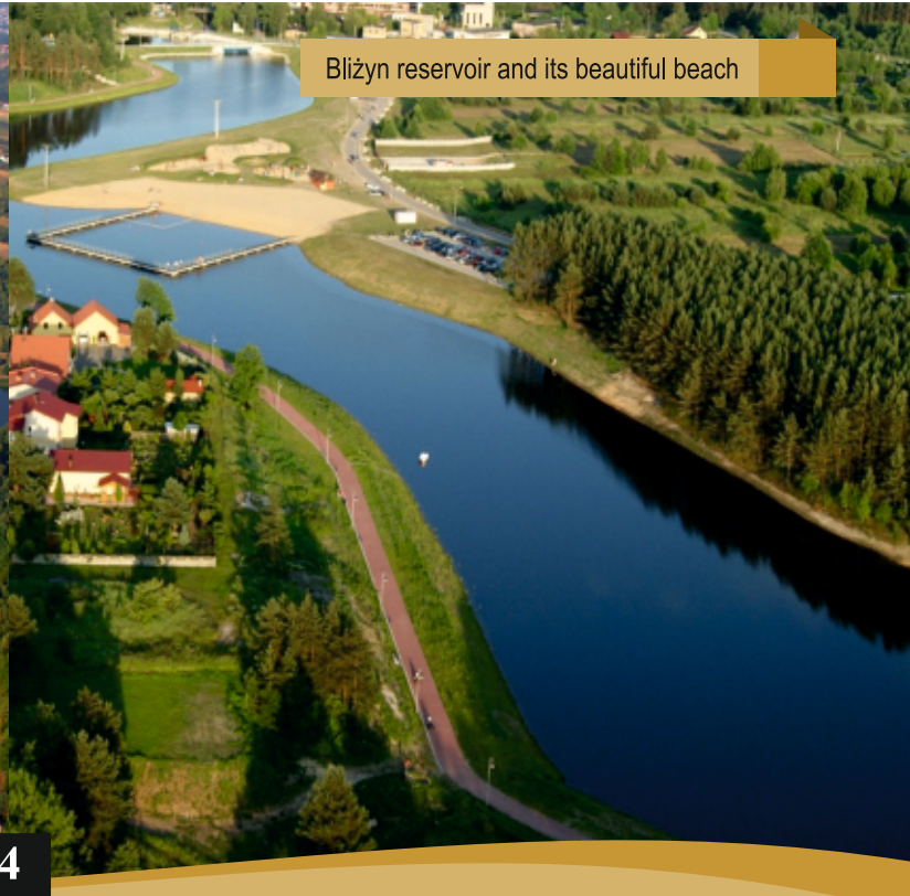
Bliżyn reservoir and its beautiful beach