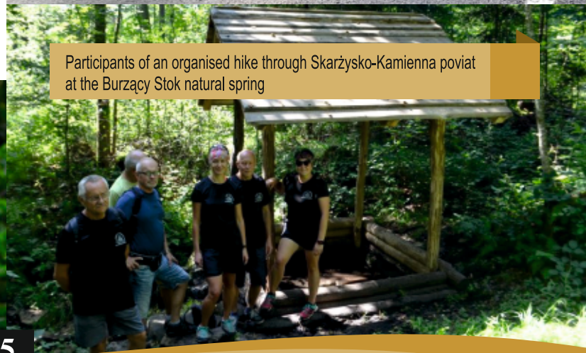
Participants of an organised hike through Skarżysko-Kamienna powiat at the Burzący Stok natural spring