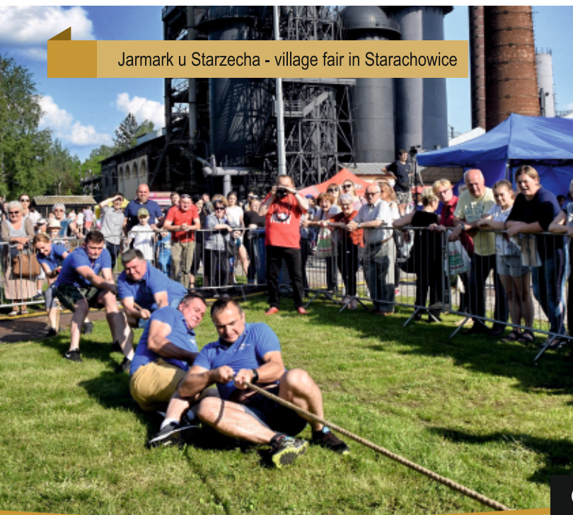
Jarmark u Starzecha - village fair in Starachowice