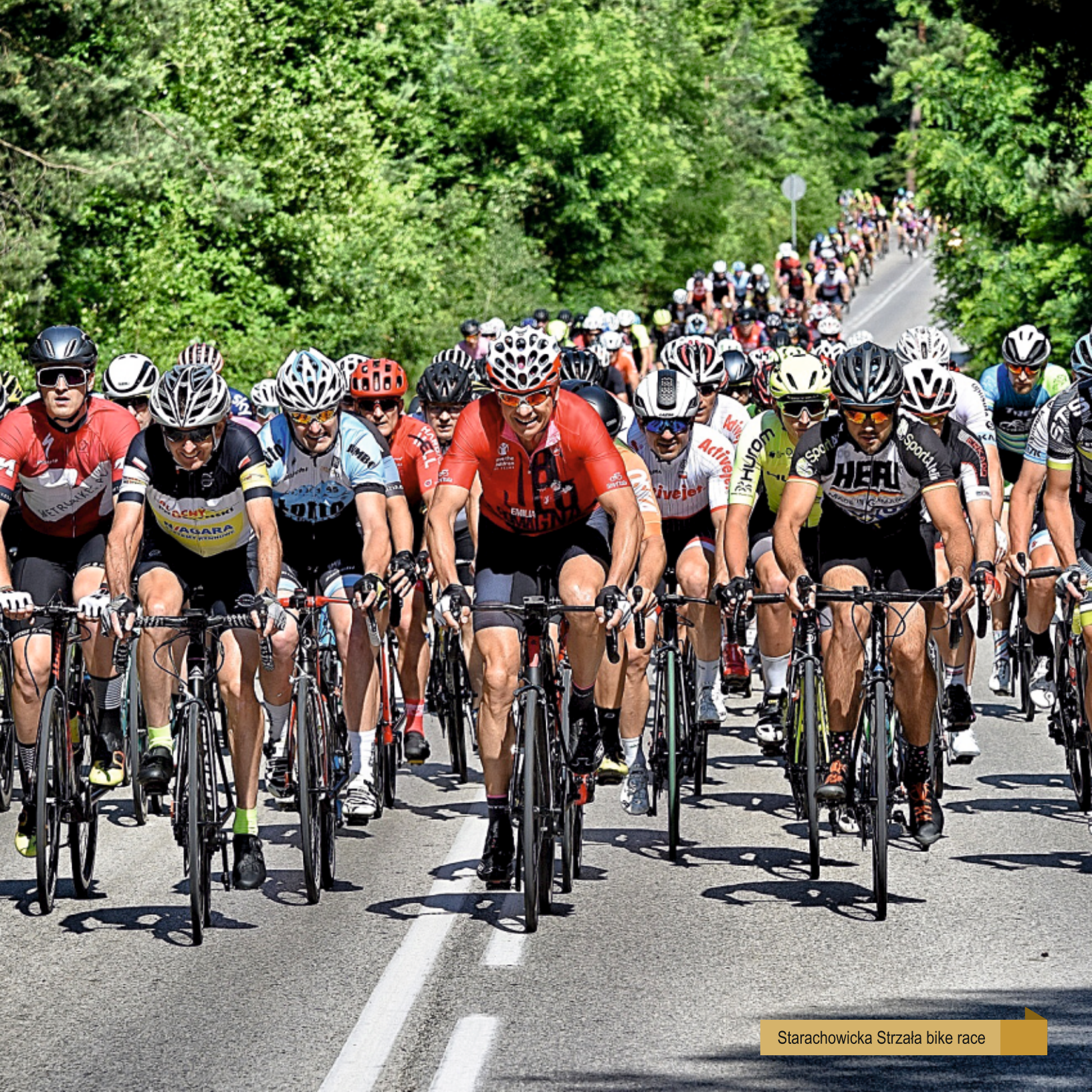
Starachowicka Strzała bike race