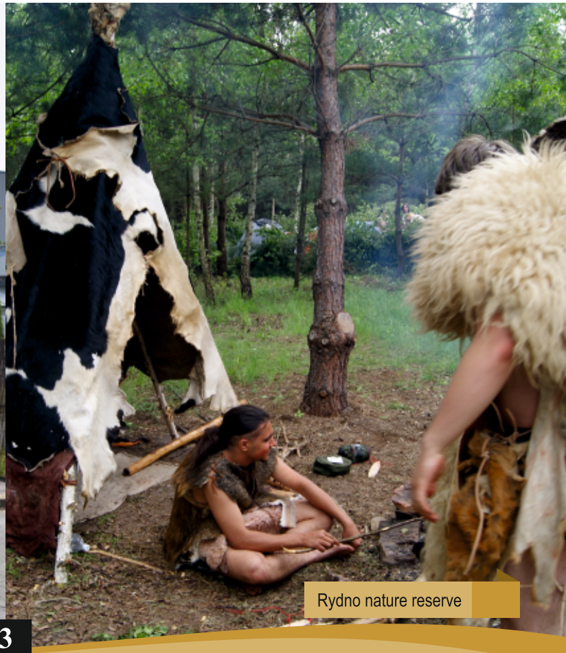
Rydno nature reserve