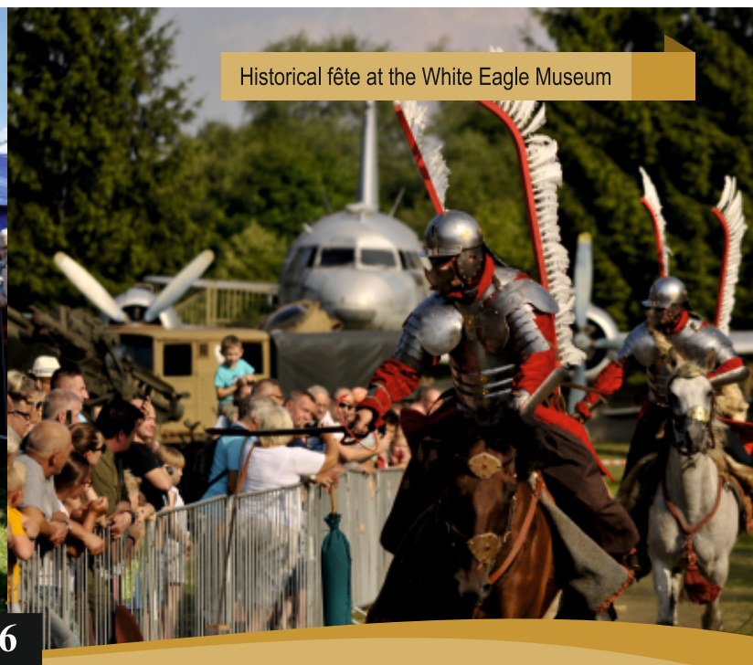
Historical fête at the White Eagle Museum