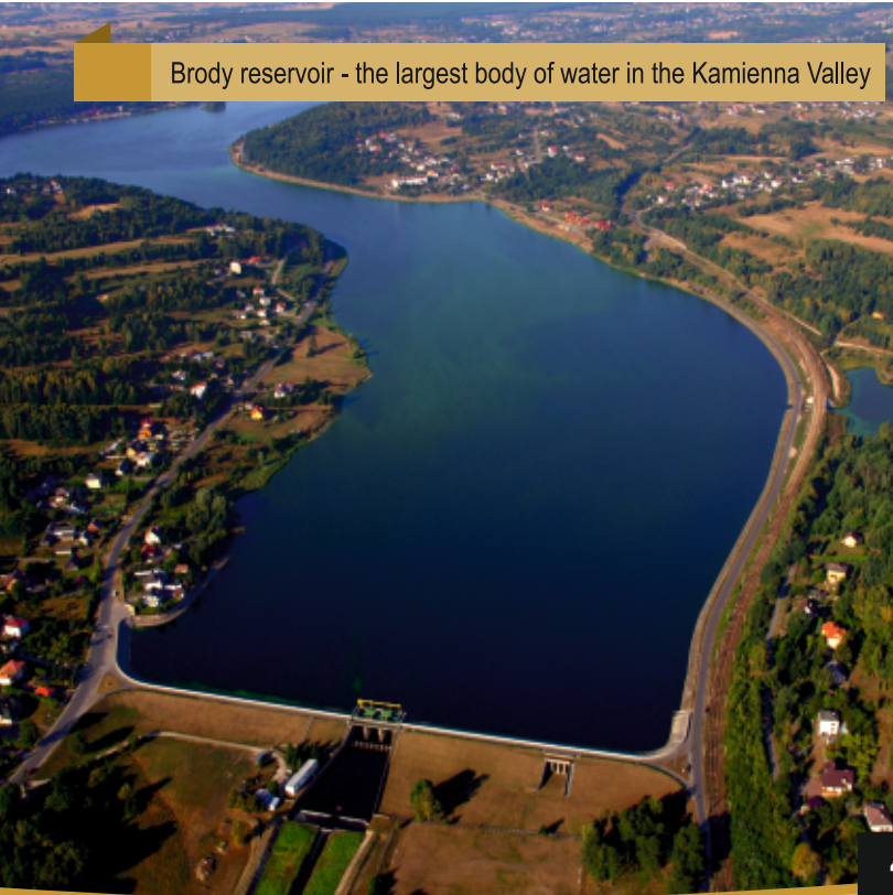
Brody reservoir - the largest body of water in the Kamienna Valley

camping enthusiasts due to the hiking trails along their shores. As well as the unique "Places of Power", the Kamienna Valley also boasts the Nad Źródłem Winery ( www.winnicanadzrodlem.pl ) and Wieś.Co ( www.wies.co ), where guests can smell the aroma of freshly baked bread and taste homemade honey from its apiary. Anyone interested in old objects of everyday use and textiles can satisfy their curiosity with a trip to the Weaver's House in Bliżyn ( www.domek-tkaczki.pl ). The Kamienna Valley also has a School of Sensitivity ( www.kapказы.art.pl ), which is a meeting place for artists and art lovers.