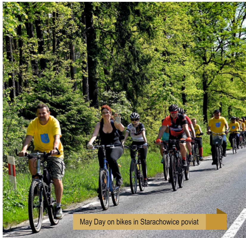
May Day on bikes in Starachowice powiat

Red "Around Starachowice By Bike" - (62 km) Wąchock - Rataje - Polana Langiewicza - Mostki reservoir - Kaczka - "Zjawa" monument - Wykus reserve - Siekierzyńskie forest - Bronkowiec - Radkowiec - Lubianka reservoir - Pasternik reservoir - Starachowice town - Lipie - Iłżecka forest - Wąchock.